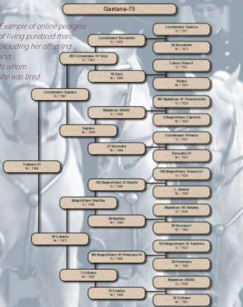
Example of online pedigree of living purebred mare, including her offspring and to whom she was bred